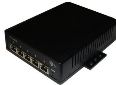
TP-SW5G-D (802.3af/at) TP-SW5G-NC TP-SW5G-24 (802.3af/at)