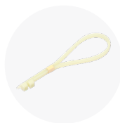
2x plastic straps