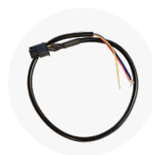
0.35 m 4pin Automotive adapter cable