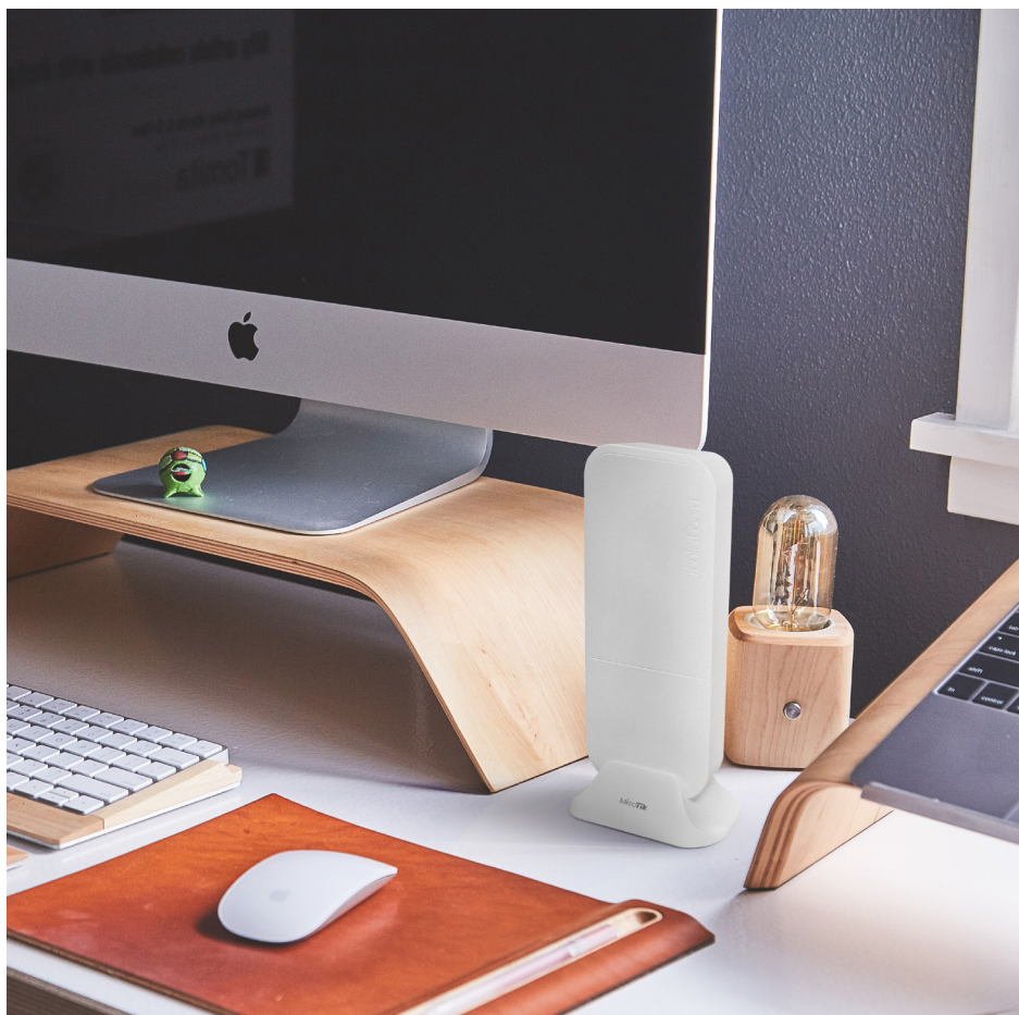
For home use