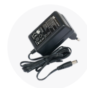
24V 0.8 A power adapter