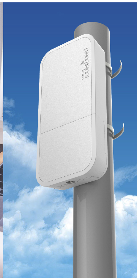
On the pole